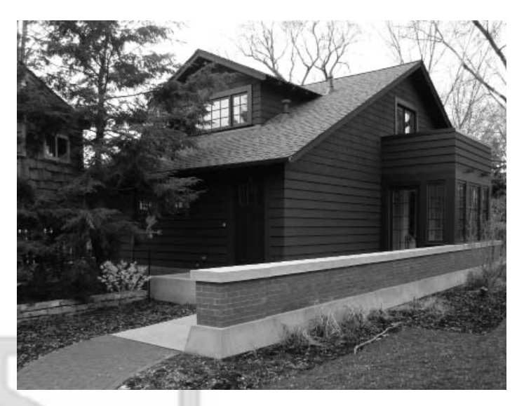
Carter House, Garage

magnificent oak tree on the north side of the walk. Thus, there is no longer street access to the garage. The front yard is now flanked by large planting beds at either end of the yard immediately adjacent to the sidewalk. These beds are filled with low growing indigenous plant material. The front-yard landscaping was also significantly improved by systematically removing the overgrown evergreens located immediately in front of the living room. The plantings that replaced these shrubs have also been located in front of the living room but they have been spread out and pulled away from the house in such a way as to allow the watertable to be clearly seen from the street.